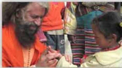
A Divine Life - Pujya Swamiji's 60th Birthday Film

...and click here to see even more videos online!