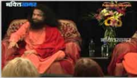
Enlightenment: Living in the Light