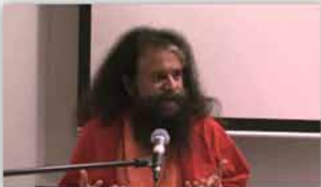
The Heart of Compassion