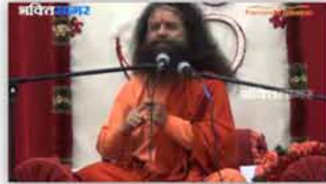
Special Guru Purnima Discourse