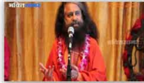
Let It Go: Finding Freedom in the Divine Flow